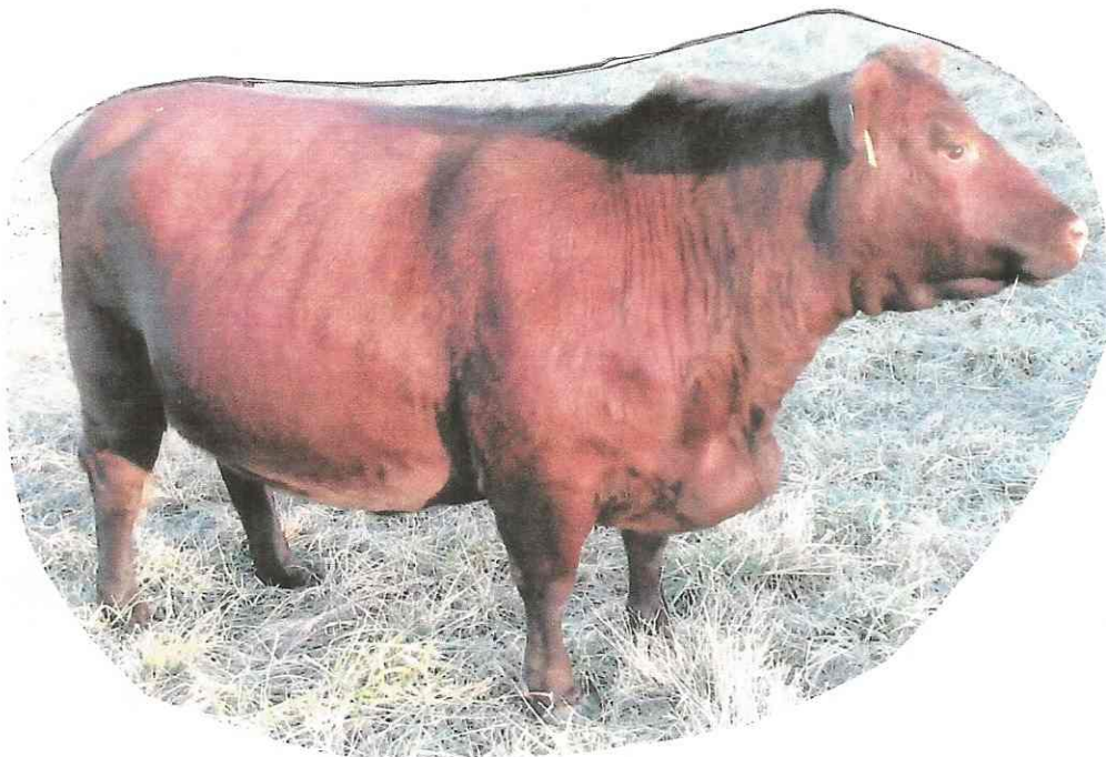
Red Heifer, one of the buddies in the herd

Do you know there can be challenges even with your buddies? You see, there are greater priorities ... even more than buddies.